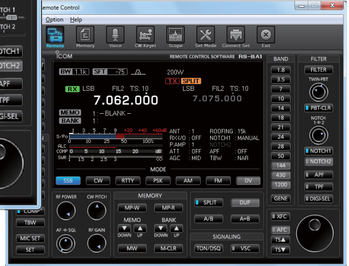
● Tuning knob controls