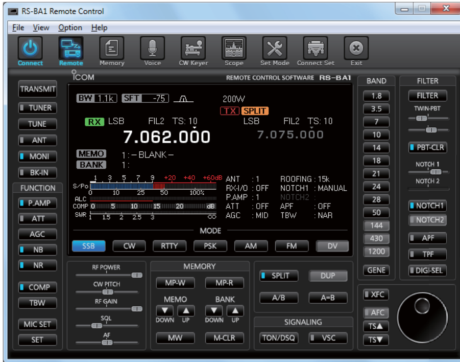
● Slider Controls